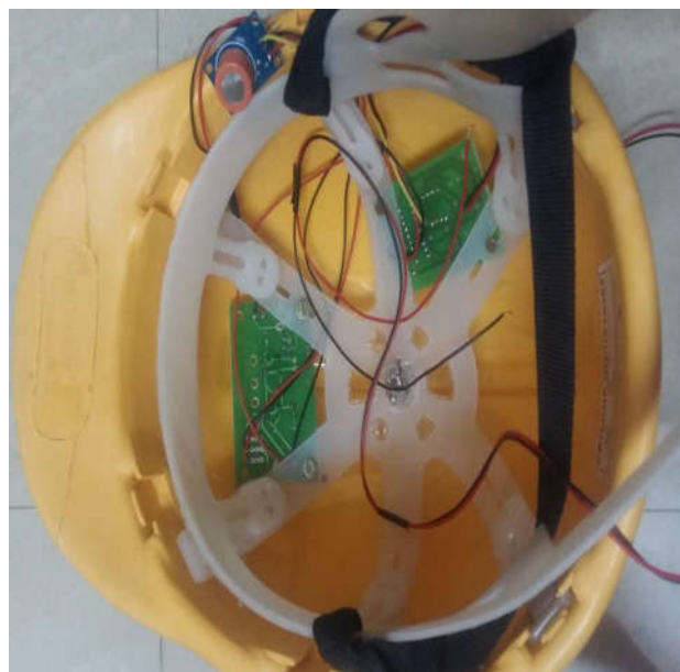
Fig 3 Transmitter unit at the helmet

The completed model of the helmet with transmitter unit is shown in fig 3. This system consists of the transmitting unit along with the alcohol detection and the heart pulse detection circuit.